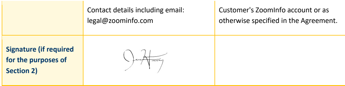
Table 2: Selected SCCs, Modules and Selected Clauses